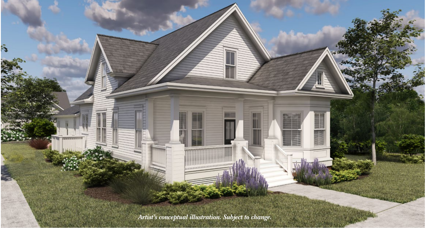
Artist's conceptual illustration. Subject to change.

314 CAPTAIN ORRIS BROWNE HOMESITE 104 BAYSIDE VILLAGE